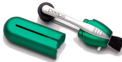
Actual Size Cleaning Tips